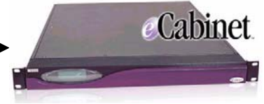
Store Indexed Image to eCabinet

Introducing Innovative Systems and Solutions Ltd.